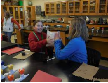
KNOW YOUR LOCAL SKIES...